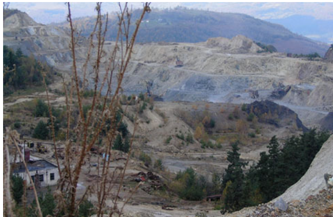
Fig. 3. Roșia Montană. Cetate opencast pit

The gold ore reserve remained from the underground works has still been processed from the underground waters in the Cetate opencast pit, because significant quantities have been lost there (over 70%). The old underground fittings (galleries, raising shafts) create great technical, technological, safety and environmental problems ( fig. 3 ).