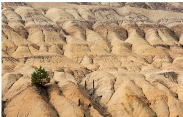
Fig. 5. Roșia Montană. Gura Roșiei tailings settling pond – Erosion processes

The main noxes to be found in the industrial areas are different forms of dust, usually containing silicon, nitrogen oxides and aerosols from the flotation area. The fine sands are windborne and the smell of almonds, typical to the sodium cyanide is frequently felt around Valea Săliștei pond. The cyanides emitted in the air under the form of gaseous hydrocyanic acid attach to the dust particles and remain in the atmosphere for about 1-3 years (Witt et al. , 2004).