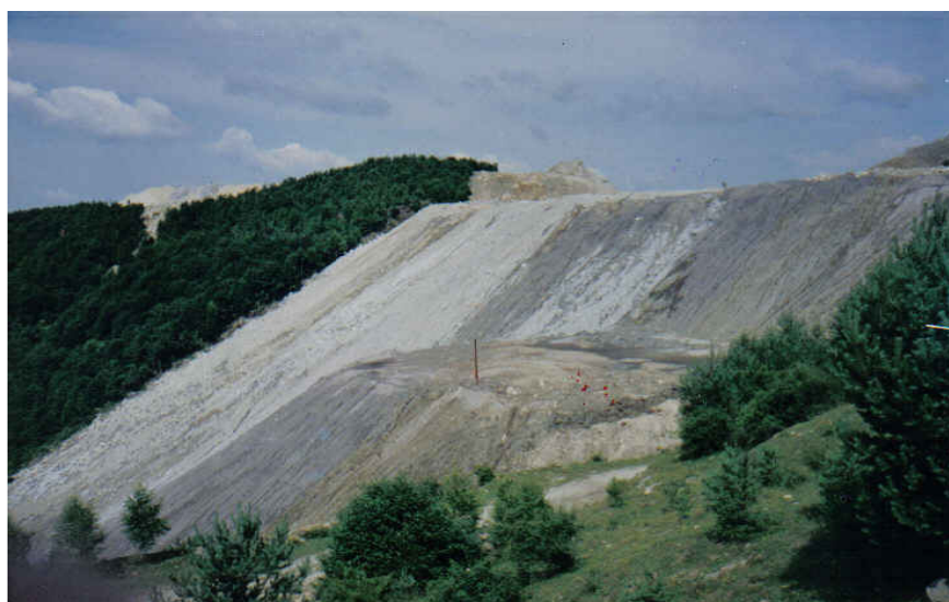
Fig. 4. Roșia Montană. Valea Verde waste dump

Valea Verde waste dump ( fig. 4 ) covers 3.8 ha and has 2 levels. The first one at elevation + 875 m and the second at elevation + 900 m; it is about 80 m high.