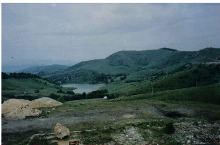
Fig. 6. Roşia Montană. Tăul Mare